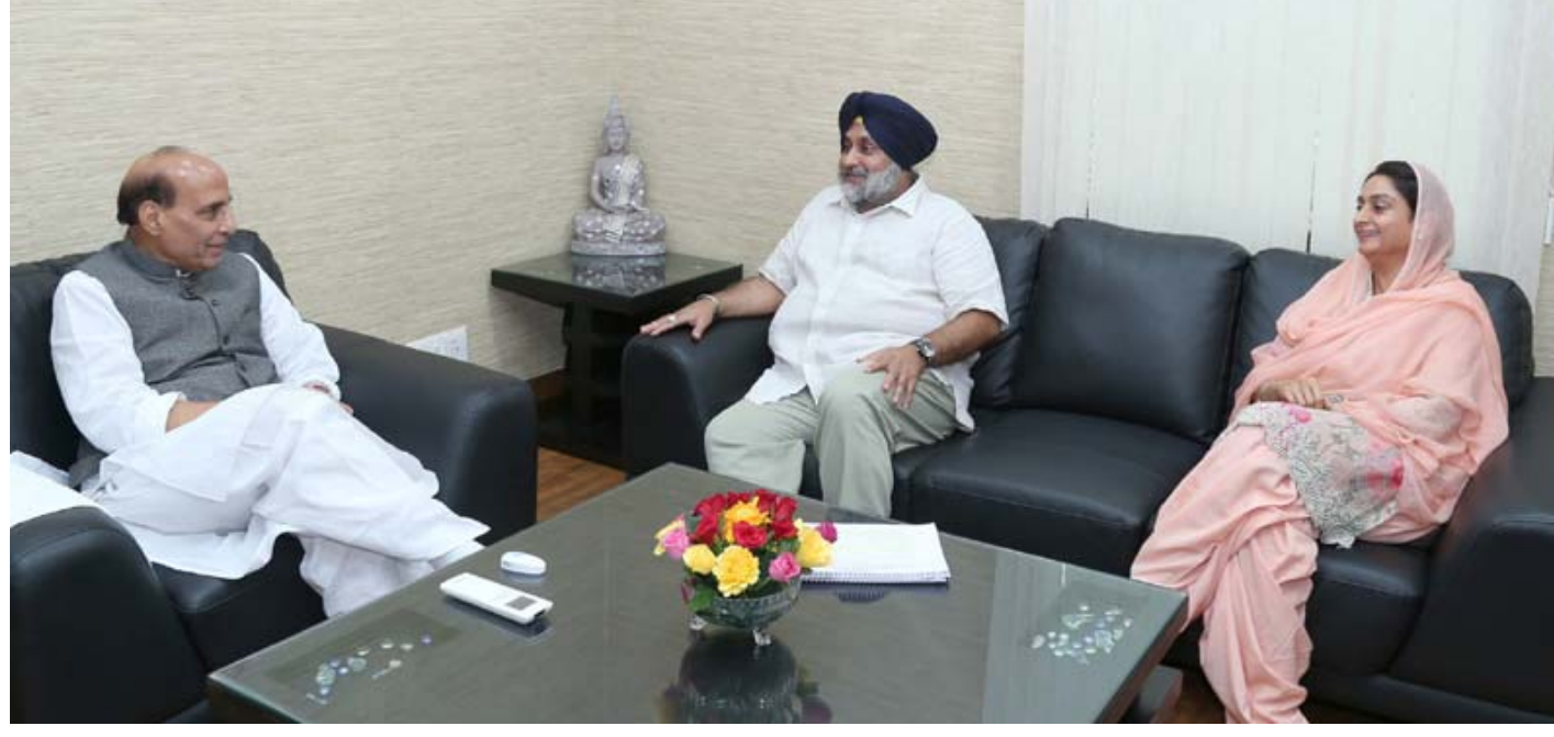
The Union Minister for Food Processing Industries, Smt. Harsimrat Kaur Badal and the Deputy Chief Minister of Punjab, Shri Sukhbir Singh Badal calling on the Union Home Minister, Shri Rajnath Singh, in New Delhi on July 15, 2016.